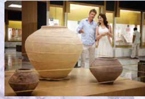
Al Ain National Muesum