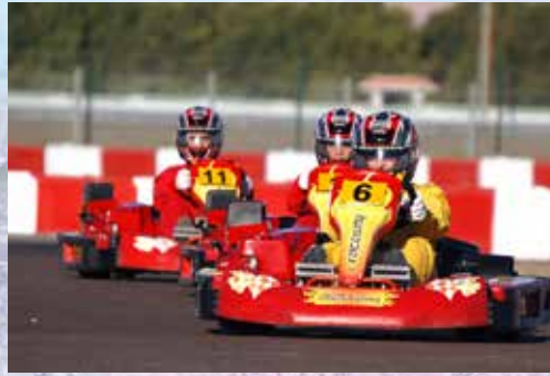
Al Ain Raceway