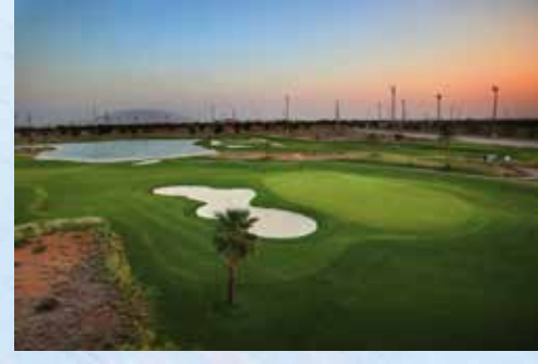
Al Ain Golf Club