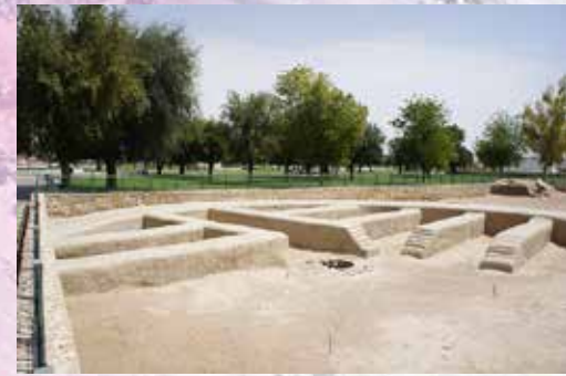
Hili Archaeological Park