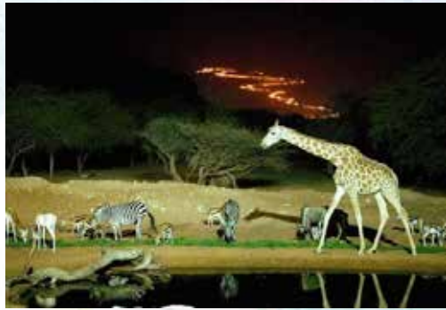
Al Ain Zoo