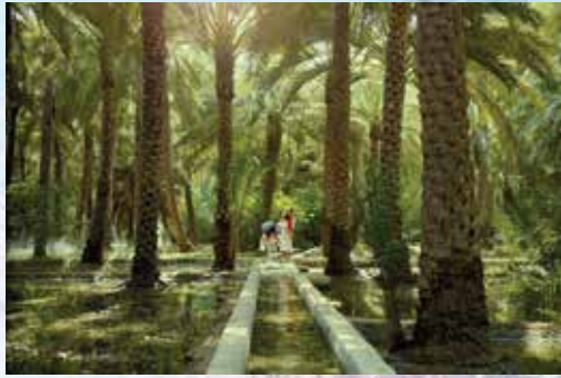
Al Ain Oasis