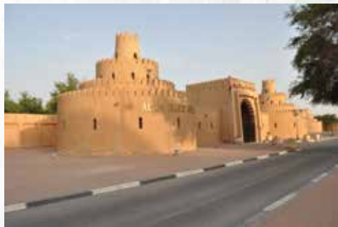
Sheikh Zayed Palace Museum