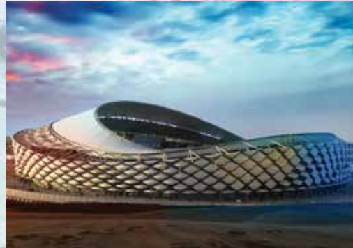
Hazza Bin Zayed Stadium