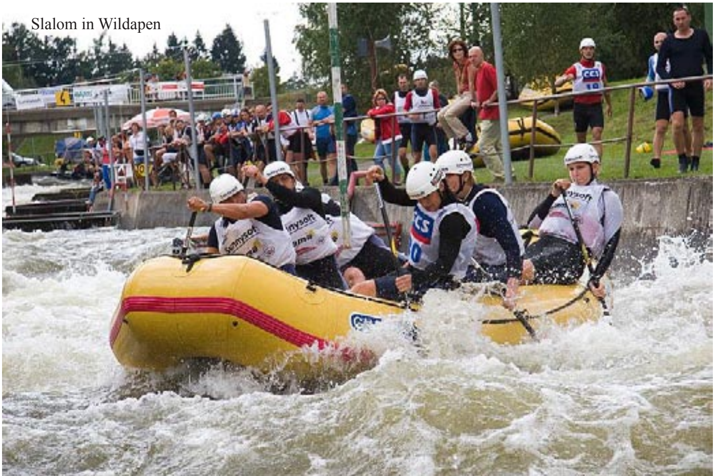
Slalom in Wildapen