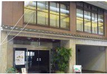
Figure 1. Image of ACCOMMODATION C