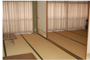
Figure 1. Image of ACCOMMODATION C